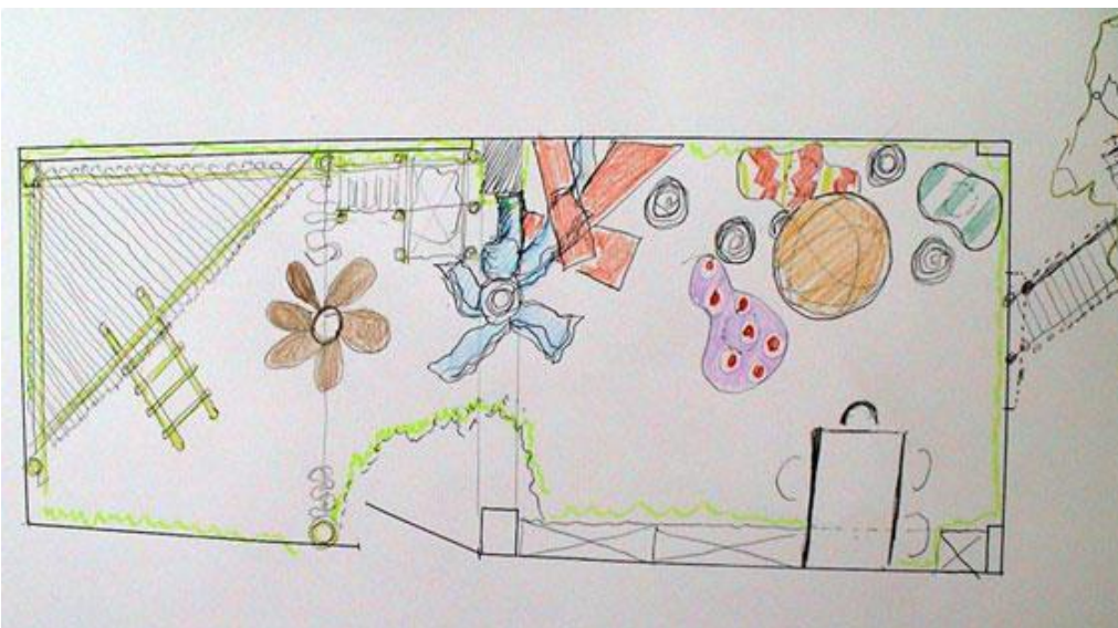
Plan drawing of ideas.