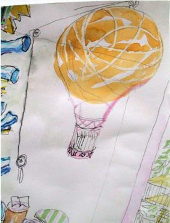
Left: Air balloon with books floating in the air. Can be lowered with the string. What hides in the air balloon basket?