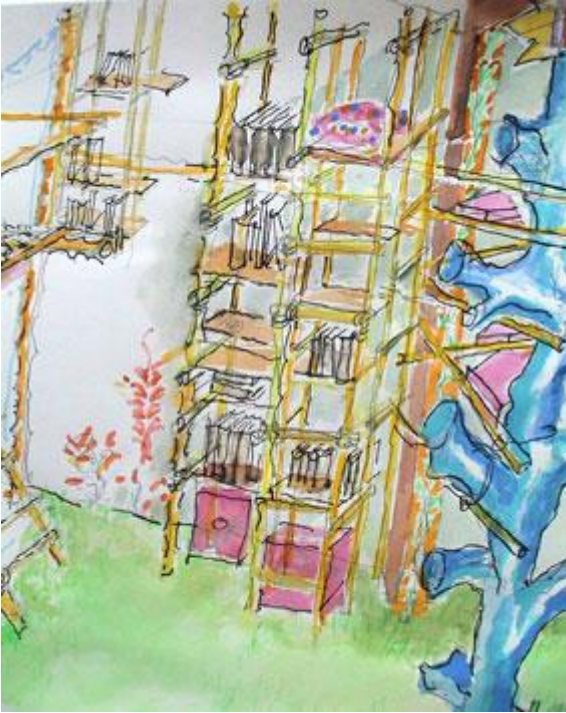
Left: Bookshelves of bamboo. Crawl onto the bamboo house or the big wood log to get the higher books.