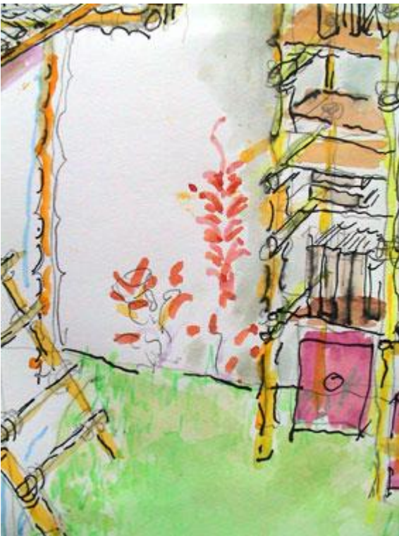
Artificial grass on the floor and painted or plastic flowers and plants on the wall.