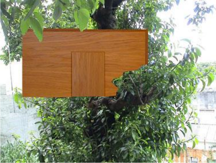
Tree House. Outside the french door of the library is a tree that would be perfect for a tree house. (Currently not in plans)