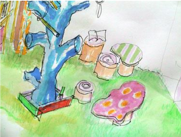
Below: Wood log chairs and tables. Tables with funny and colorful shapes.