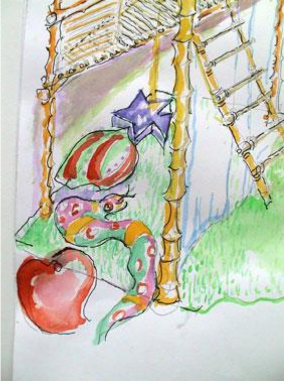
Left: Pillows in funny shapes to sit on the floor with. Can be used in plays.