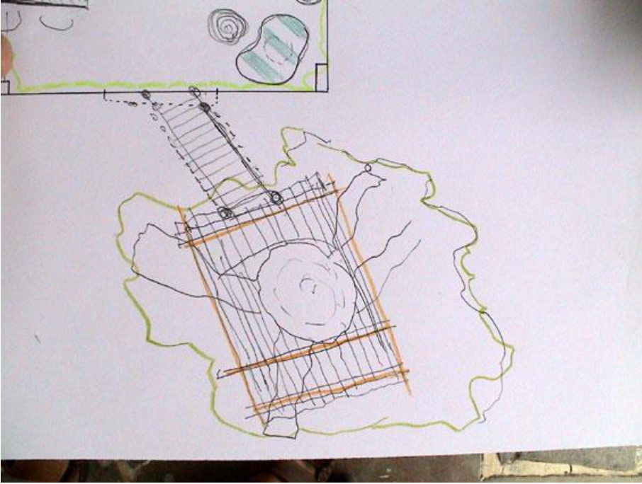
Plan drawing of tree house.